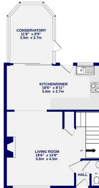
GROUND FLOOR 524 sq.ft. (48.7 sq.m.) approx.